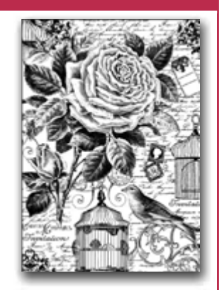
DFSA4195 Mix Media Rice Paper Size A4