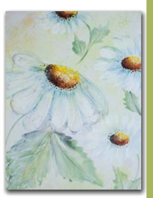
Accentuated reliefs and light effects obtained with the application of the new Crystal Resin