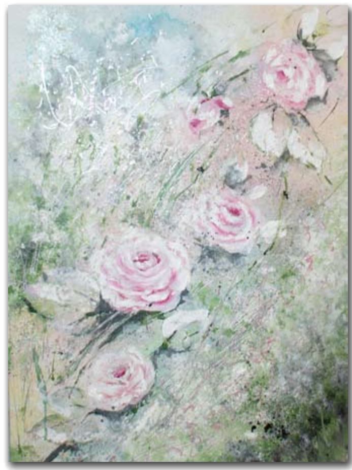
Soft colours create Shabby Chic atmopheres with Mix Media 3D Pastes, Allegro and Vivace acrylics, Aquacolor.