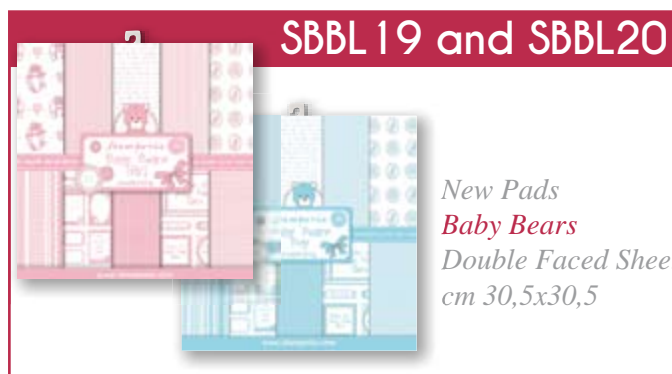
New Pads Baby Bears Double Faced Sheets cm 30,5 x 30,5

Special ideas for the happy event: a creative use of the new papers, coordinated with Sizzix Die Cuts.