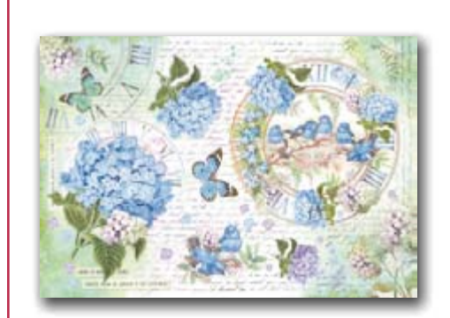
DF$354 Hydrangeas Rice Paper cm 48x33