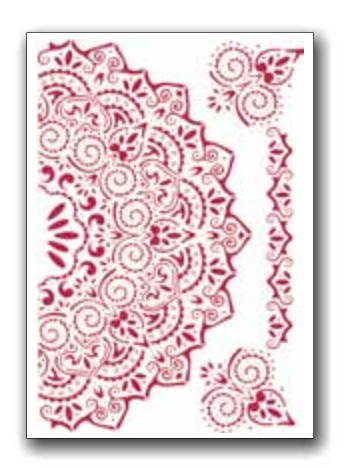
KSM036 cm 30x44